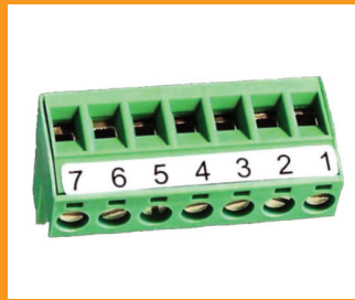
LD-7P 7 position plug terminal for wiring (included)