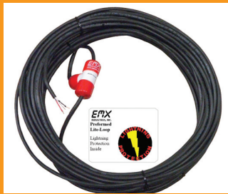
PR-XX (light preformed loop with lighting protection)

The ULTRAMETER™ display makes installation, set-up and troubleshooting easy. Each time a vehicle is moved onto the loop, the display indicates the sensitivity necessary to detect vehicle. Simply set the sensitivity to the value displayed to detect the vehicle. Interference or crosstalk from adjacent loops or other sources are displayed as a constantly varying number on the ULTRAMETER™. This condition may be avoided by maintaining a minimum of 5 kHz separation in multi-loop applications.