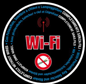
KIT K800 Wi-Fi

FIRST KITS IN THE WORLD WITH ALL ACCESSORIES TOTALLY WIRE-FREE