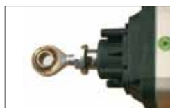
Round joint for stroke adjustment