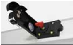
Release system protected by metal lock with release key at the inside.