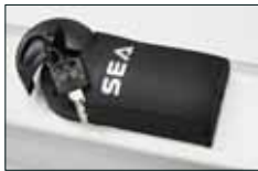
Release with metal lock protection