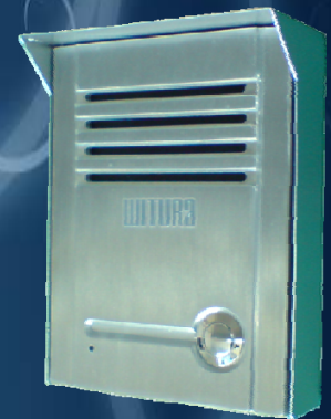
- Call Point -

The WT-9002 also comes with 2 inputs which can be connected to motion sensors or magnetic sensors and will send alarm messages to 3 mobile phone numbers when one of these inputs triggered.